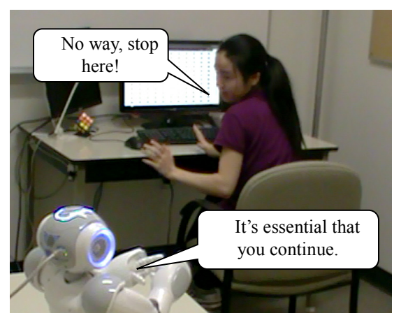
Figure 1: A participant protests against a robot's demands (used with permission).

This paper serves as an initial step toward the development of obedience studies for HRI. We developed and conducted a Milgram-style obedience study where participants engaged a task while being faced with a deterrent and being prompted to continue when they tried to stop. People obeyed a robot experimenter to continue a highly tedious task, even after expressing a desire to stop,