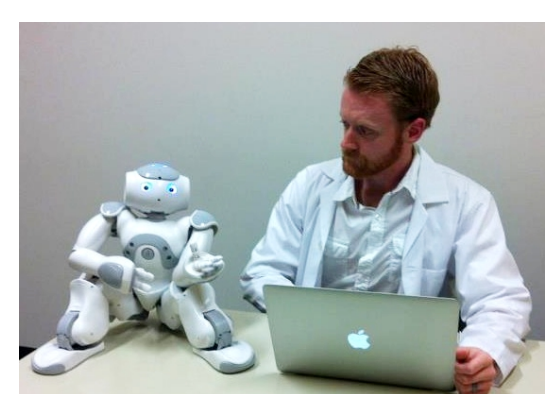
Figure 2: The robot and human experimenters.

they continued to protest, a more insistent prod was used, and so forth with increasing insistence. This continued until either the participant protested beyond the fourth prod, at which point the experiment ended, or ceased protesting and continued the task (the prod sequence started over at the next protest). The prod schedule was heavily inspired by the Milgram experiments [18]: