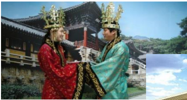
Silla Culture Experience Center

The construction of Bulguksa Temple was begun by Gim Daeseong in 751 A.D., during the reign of King Gyeongdeok, and was completed in 774 A.D during the reign of King Hyegong. Its construction was begun and completed parallel with that of Seokguram.